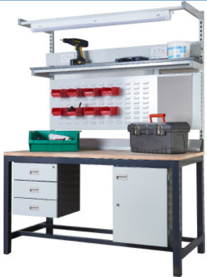
Heavy Duty Workbench - 1200kg UDL - Beech - Displayed with Accessories