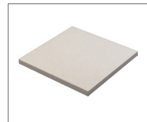
20mm Laminate Worktop