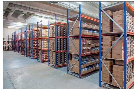
TUFF Longspan Shelving Client Installation