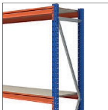
Cross beam shelf supports