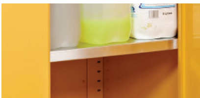
Adjustable galvanised shelf