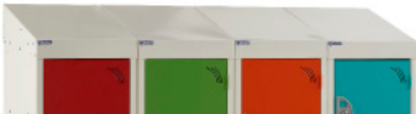
Optional sloping tops available