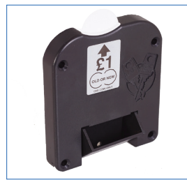
Coin Return Lock SKU 114080993