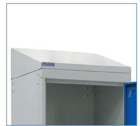
Sloping Top SKU 114080994-97