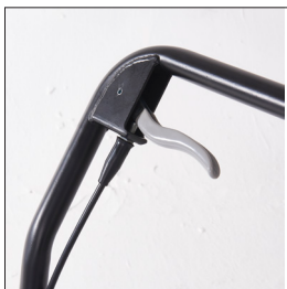
Slow release handle